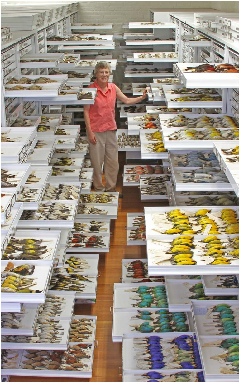
Figure 2. Natural history museum collections are tremendous repositories of specimens and data of many sorts, including phenotypes, tissue samples, vocal recordings, geographic distributions, parasites, and diet. doi:10.1371/journal.pbio.1001466.g002

widespread occurrence of lateral gene transfer. However, the phylogeny of these organisms and their genes remains critical to understanding their scope, origins, distributions, and change over time [92]. The advent of metagenomic sequencing of environmental microbial communities has revealed greater diversity and flux of genotypes than ever imagined, defying conventional species concepts and presenting a major challenge to applying traditional evolutionary and ecological theory to understanding microbial diversity